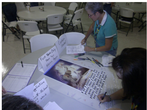
Signing up for Kairos cookies agape...